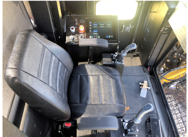
Operator Station with ergonomic seat & joystick controls.

Video of the Dual Clip Applicator: https://tinyurl.com/2s3nvxvp